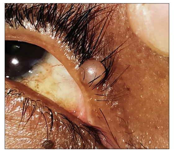
Figure 1: Well-defined translucent-white dome-shaped papule on the right upper eyelid near the medial canthus.

Apocrine hidrocystoma is a rare, usually solitary, benign apocrine gland tumour, frequently affecting the head and neck region of middle-aged to elderly individuals with typical clinical and