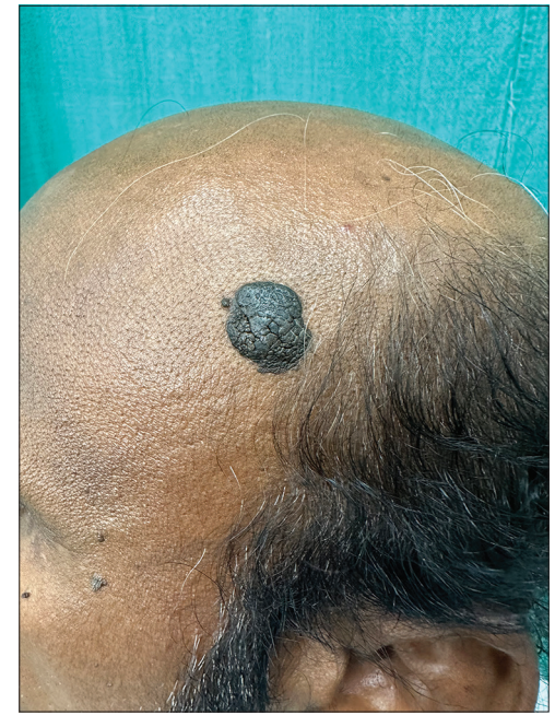
Figure 1: Dark raised lesion in the scalp.