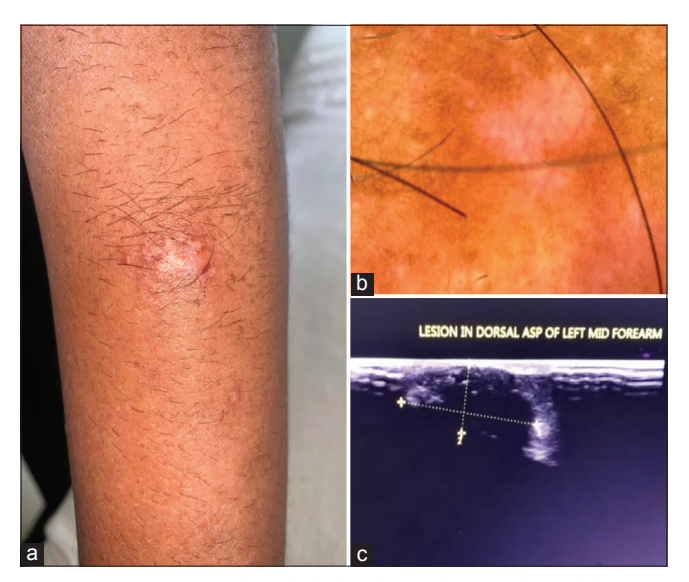
Figure 1: (a) Firm to hard lobulated nodule over the left forearm measuring 3 × 3 cm with pigmentary changes. (b) Dermatoscopic examination revealing a whitish structureless area with an erythematous hue. (c) Ultrasonography of soft tissue shows a welldefined lesion with peripheral calcification in the subcutaneous tissue with no vascularity or surrounding changes, indicating a calcified cyst.