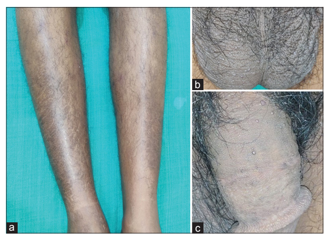
Figure 1: (a) Ichthyotic macules on legs. (b) Skin-coloured papules on the scrotum. (c) Skin-coloured papules on the shaft of the penis.