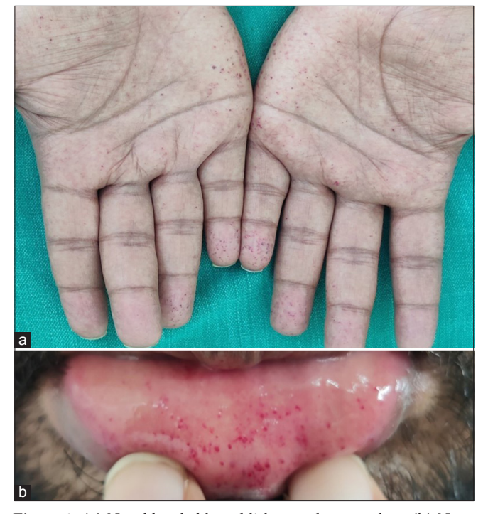
Figure 2: (a) Non-blanchable reddish macules on palms. (b) Nonblanchable reddish macules on lips.

thyroid function test and ultrasound of the abdomen were normal. Doppler study of lower limbs showed subcutaneous oedema with no vascular abnormality. The postural variation was suggestive of either stage 1 lymphoedema or autonomic dysfunction. Slit-lamp examination of the eyes revealed bilateral cornea verticillata and tortuous retinal vessels were detected on fundoscopy, both of which are features of Fabry disease. The left ventricular strain pattern was identified in the electrocardiogram. Echocardiography showed concentric left ventricular hypertrophy. Magnetic resonance imaging of the brain and nerve conduction