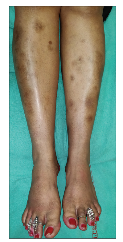
Figure 3: Lesions healed after 6 months of anti-tubercular therapy leaving behind post-inflammatory hyperpigmentation and atrophy at few areas.

Although erythema induratum is a rare form of cutaneous TB, it should always be kept in mind, especially in areas of high endemic zone like India. In our patient, diagnosis was made on skin biopsy which shows epithelioid cell granuloma