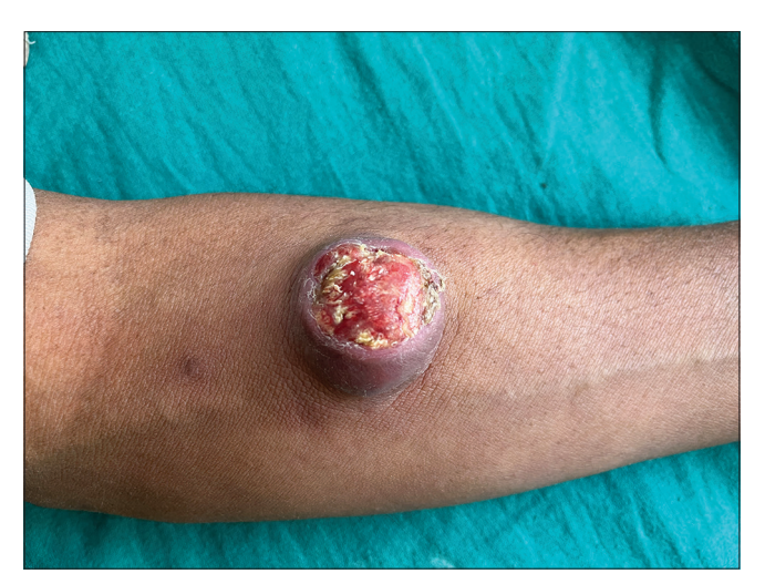
Figure 1: Giant ulcerating pilomatricoma: Erythematous ulcerated nodule with yellowish crusting seen on flexor aspect of the left forearm.

in mind. Macroscopically, the lesion was clearly defined and had a grey-tan colour. Microscopically, an unencapsulated