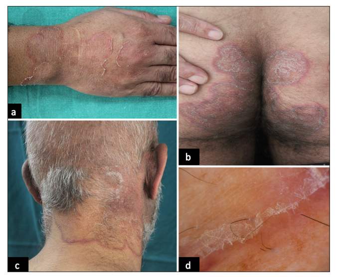
Figure 1: Well-defined annular plaque with central clearing and trailing scale and advancing erythematous border over dorsum of (a) the right hand, (b) buttock and (c) nape of neck, (d) dermoscopy of lesion showing whitish scale with advancing erythematous border (DermLite dl3 gen, ×10 magnification, Made in USA).

A 46-year-old male presented with well-defined annulare plaque with central clearing over right dorsum of hand, nape of neck and buttocks since 3 months [Figure 1a-c]. The lesions were accompanied by itching. He was being treated as case of dermatophyte infection with topical and systemic antifungal without much relief. Dermoscopy of lesions revealed whitish trailing scale with advancing erythematous edge [Figure 1d]. Potassium hydroxide (KOH, 10%) mount was negative. The histopathology of lesion revealed mild spongiosis, parakeratosis and minimal perivascular and periappendegeal lymphocytic infiltrate in upper dermis [Figure 2a]. He was labelled as a case of erythema annulare centrifugum (EAC). He had history of weight loss in past 3 months accompanied by non-productive cough. High-resolution computed tomography