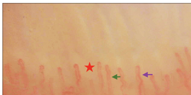
Figure 3: Nailfold capillaroscopy of healthy control with metabolic syndrome showing dilated capillary (purple arrow), tortuous capillary (green arrow) and capillary dropout (red star).