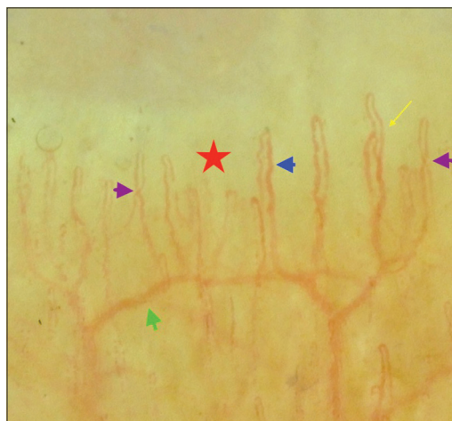
Figure 2: Nailfold capillaroscopy of psoriatic patient with metabolic syndrome showing subpapillary venous plexus (green arrow), criss-cross capillary (purple arrows), avascular area (red star) ramified capillary (yellow arrow) and dilated capillary (blue arrow).

Twenty-five psoriatic patients had MeS and 50 did not have MeS. The body surface area (BSA) and PASI score among both groups was non-significant ( P = 0.74 and 0.61 , respectively). Budding capillaries and Bushy capillaries were higher in psoriatic patients with MeS; however, microhaemorrhages were significantly higher in psoriatic patients without MeS. Dilated and giant capillaries were equal in both groups [Table 3].