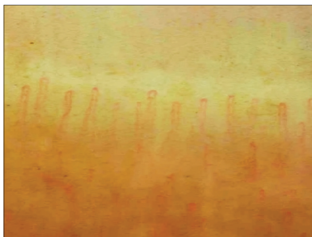
Figure 4: Nailfold capillaroscopy of healthy control showing regular and parallel arrangement of nailfold capillary.

the severity of the disease correlated with the higher rate of obesity and DM; however, HTN and hyperlipidaemia are not independently associated with severe disease. [15] A study by Kothiwala et al. found that the prevalence of MeS increased with increasing disease severity. [16] A study by Gisondi et al. , in 2007, found no relationship between MeS prevalence and psoriasis severity. [17] Similarly, Fernández-Armenteros et al. , in 2019, found no relation between psoriasis severity and MeS. [18] In our study, among each parameters of MeS systolic BP, obesity (Waist Circumference), triglycerides and FBS were significantly higher in psoriatic patients than in healthy controls, similar observations were reported by Kothiwala et al. in 2016. [16]