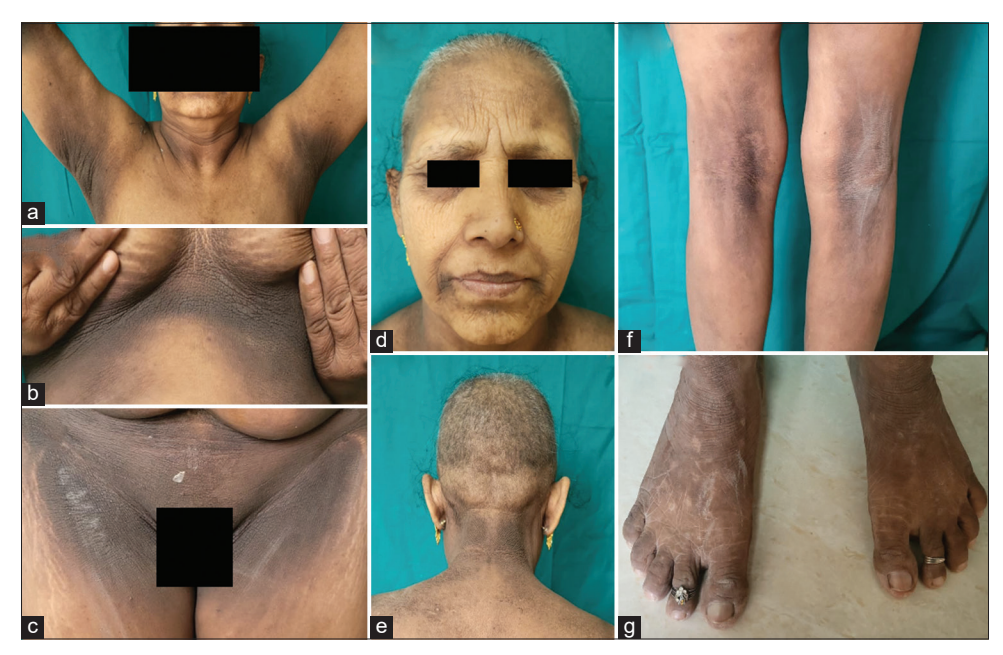
Figure 1: Thickened hyperpigmented velvety skin present over (a) axillary folds, (b) inframammary area, (c) groin, (d) periocular and perioral and periocular area, (e) neck, (f) cubital fossa and (g) both feet.