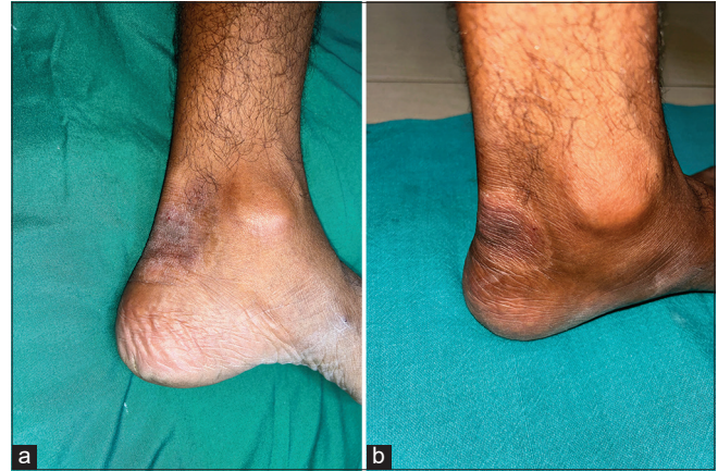
Figure 4: (a) A well-defined, oval, erythematous to hyperpigmented plaque present over the posterior aspect of the right foot with scaling. (b) Mild improvement was seen in the form of a decrease in erythema and scaling of the plaque after twice daily application of crisaborole 2% ointment for 28 days.

Crisaborole, when applied topically, penetrates the epidermis and dermis and reaches quantifiable levels in the plasma. The protein binding is 97% predominantly to albumin. The metabolism is through its several inactive metabolites through hydrolysis and oxidation, eliminated through the kidneys. Its advantage over topical corticosteroids and calcineurin inhibitors is the eliminated risk of development of malignancies in the future, making it a safer drug for long-term management. The drug is presumed to be safe in the