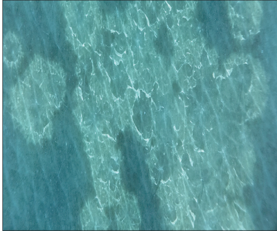
Figure 3: Contact dermoscopy (DERMLITE DL5, 365 nm woods lamp mode, ×10) showing yellow-green fluorescence.