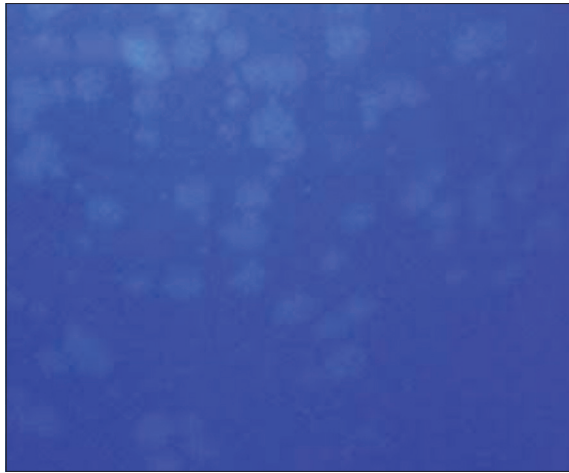
Figure 4: Photograph showing green-yellow fluorescence as seen through woods lamp magnifier.

is attributed to the presence of pityrialactone [Figure 3]. Figure 4 shows photograph of pityriasis versicolor as seen through woods lamp magnifier showing green-yellow fluorescence. Early diagnosis facilitated by this technique allows for the timely initiation of appropriate therapy, thereby improving patient outcomes and reducing the risk of complications.