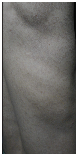
Figure 1: Multiple discrete to coalescing hyperpigmented brownish scaly macules distributed over the right side of trunk.

Dermoscopy, with its ability to magnify and visualise subtle skin changes, further enhances the diagnostic accuracy of Wood's lamp examination, especially at the bedside. Bedside demonstration of fluorescence using the 365 nm Wood's lamp mode of dermoscopy [Figure 2] is a valuable tool in the diagnosis of pityriasis versicolor, offering a rapid and non-invasive means of confirming the clinical suspicion. The green-yellow fluorescence observed in pityriasis versicolor lesions under Wood's light