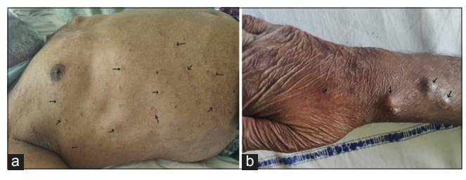
Figure 2: (a) Showing ill-defined erythematous plaques over anterior and posterior aspect of trunk and chest wall (black arrows), (b) showing multiple well-defined skin-coloured nodules noted over anterior aspect of forearm and wrist (black arrows).