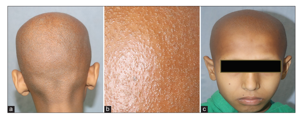
Figure 1: (a-b) Multiple skin-coloured follicular papules on scalp and (c) eyebrows with non-scarring universal alopecia.

A 12-year-old boy presented with diffuse hair loss all over the body for 2 years of age. Hair was normal at birth; however, the patient lost hair at the age of 2 years followed by the development of tiny skin-coloured lesions on scalp. There was no family history of similar complaints. Clinical examination revealed multiple skin-coloured follicular papules on scalp, eyebrows, legs and arms with non-scarring universal alopecia [Figure 1]. There were few hair on scalp, approximately 10-15 in number, with positive hair pull test. Dermoscopy of the scalp revealed pigtail hair, coiled hair, non-erupted vellus hair and a single Monilethrix hair [Figure 2]. However, trichogram did not reveal any specific findings. Histopathology showed sparse superficial lymphohistiocytic infiltrate with increased number of arrector pili with normal number of follicles suggestive