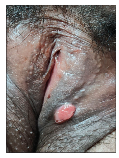
Figure 1: A 1.5*1 cm sized single soft red-coloured nodule over the outer aspect of the left side of external genitalia.

circumscribed tumour located underlying the epidermis. It was composed of slender fronds of connective tissue lined by an outer columnar epithelial layer which showed an oval, pale-staining nucleus near the base with faintly eosinophilic cytoplasm and inner myoepithelial cells layer with deeply basophilic nuclei. Mitotic figures were absent [Figure 2]. It was histologically suggestive of hidradenoma papilliferum.