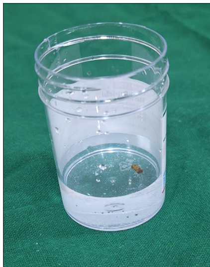
Figure 3: Specimen collection.