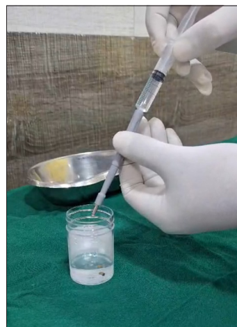
Video 1: Video showing formalin flush.