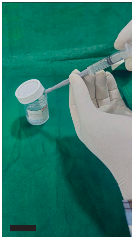
Figure 2: Formalin push with partially closed lid.