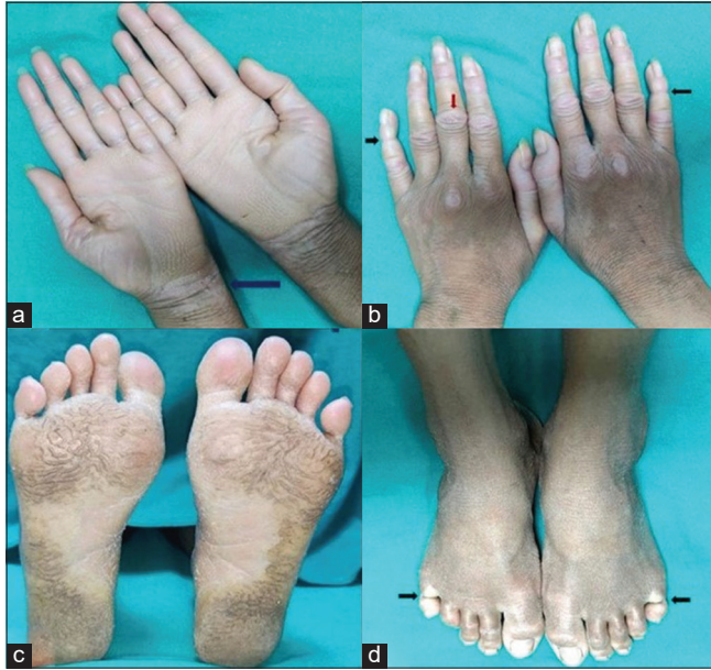
Figure 1: (a) Diffuse honey-comb type of palmar keratoderma extending proximally over wrist. (blue arrow). (b) Diffuse xerosis over dorsum of hands with glazed appearance of all the fingers and hyperkeratosis over proximal interphalangeal joints. (red arrow). Pseudoainhum involving the distal interphalangeal joints of 5th finger bilaterally (black arrows). (c) Diffuse plantar keratoderma with some sparing of the medial aspect of soles. (d) Pseudoainhum involving bilateral 5th toe (black arrows).

bilaterally [Figure 1]. Examination of nails, teeth and oral mucosa revealed no abnormality. Haematoxylin and eosin-stained section from palmar skin revealed hyperkeratotic, stratified squamous epithelium with vacuolar degeneration and prominent keratohyaline granules [Figure 2]. Audiogram revealed no abnormality. Mutational analysis could not be performed due to financial constraints. On the basis of history, clinical examination and investigations, a diagnosis of Camisa syndrome was made. After informed consent, the patient was started on oral isotretinoin 20 mg once daily and was referred to plastic surgery for management of pseudoainhum. Response to treatment could not be assessed as the patient lost to follow-up.