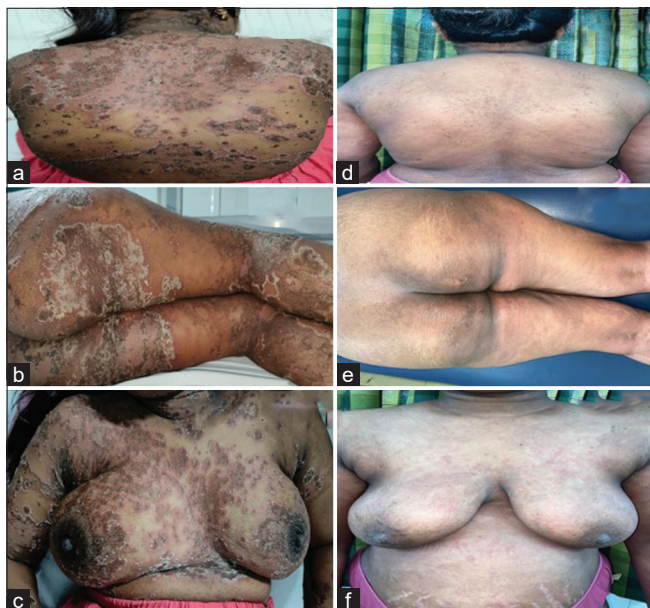
Figure 1: Multiple erythematous to hyperpigmented tender annular plaque of size approximately 3×3 to 5×6 cm studded with pinhead size pustular lesions on peripheral rim over (a) back, (b) bilateral buttocks and lower limbs, (c) chest and lesions healed post treatment over (d) back, (e) bilateral buttocks and lower limbs, (f) chest.

Laboratory tests showed elevated total counts, low haemoglobin, low Vitamin D3, decreased total calcium, raised serum alkaline phosphatase, raised C-reactive protein, erythrocyte sedimentation rate (ESR) and low albumin. Culture and sensitivity report of pus showed growth of normal skin flora. A skin punch biopsy from a pustular lesion over the right arm revealed hyperplastic squamous epithelium with focal parakeratosis and Munro's microabscess containing neutrophils and necrotic debris. Intraepidermal spongiform pustules of Kogoj were also present. The dermis showed perivascular lymphoplasmacytic and polymorphonuclear infiltrate [Figure 2].