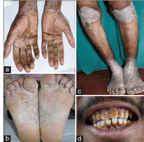
Figure 3: Second patient (a and b) diffuse, transgradient palmoplantar keratoderma over bilateral palms and soles, (c) Psoriasiform plaques over bilateral knees and (d) plaque accumulation and carious teeth.

diagnosis. Histopathology could not be done due to patient's negative consent. Genetic study of cathepsin C gene (CTSC) for mutations should be done to confirm the diagnosis, though it was not done in our case due to limited resources. Our second patient was born out of a non-consanguineous marriage and had no family history. This may point towards a de novo mutation. Further, genetic screening of family members may be required to ascertain the true nature of the mutation. PLS is a rare autosomal recessive disorder of keratinisation characterised by PPK, periodontitis and a tendency for recurrent pyogenic skin and systemic infections. It was originally described in 1924 by two French physicians, Papillon and Lefevre. [1] It has an estimated prevalence between 1/250,000 and 1/1,000,000 in the general population. [2] It usually presents during 1 st 4 years of life. Although the exact pathogenesis of PLS remains unclear, this condition results from loss-of-function mutations in the