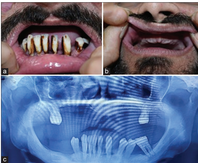
Figure 2: First patient (a) lower teeth showing plaque accumulation and deep periodontal pockets, (b) loss of majority of upper teeth and (c) orthopantomogram showing 'floating in air' appearance with resorption of alveolar process.

diagnosis. Histopathology could not be done due to patient's negative consent. Genetic study of cathepsin C gene (CTSC) for mutations should be done to confirm the diagnosis, though it was not done in our case due to limited resources. Our second patient was born out of a non-consanguineous marriage and had no family history. This may point towards a de novo mutation. Further, genetic screening of family members may be required to ascertain the true nature of the mutation. PLS is a rare autosomal recessive disorder of keratinisation characterised by PPK, periodontitis and a tendency for recurrent pyogenic skin and systemic infections. It was originally described in 1924 by two French physicians, Papillon and Lefevre. [1] It has an estimated prevalence between 1/250,000 and 1/1,000,000 in the general population. [2] It usually presents during 1 st 4 years of life. Although the exact pathogenesis of PLS remains unclear, this condition results from loss-of-function mutations in the