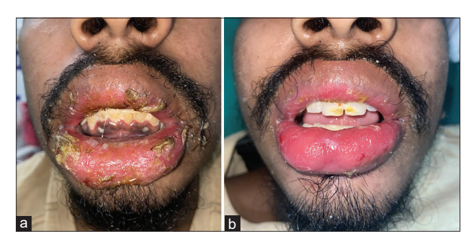
Figure 1: (a) Erythematous oedematous swelling of lips with adherent yellowish crusts showing mucoid discharge from a few areas on squeezing. (b) Underlying erythematous oedematous glistening surface of both lips on removal of crusts with saline-soaked gauze.