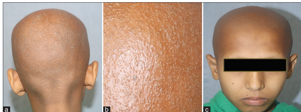
Figure 1: (a-b) Multiple skin-coloured follicular papules on scalp and (c) eyebrows with non-scarring universal alopecia.

A 12-year-old boy presented with diffuse hair loss all over the body for 2 years of age. Hair was normal at birth; however, the patient lost hair at the age of 2 years followed by the development of tiny skin-coloured lesions on scalp. There was no family history of similar complaints. Clinical examination revealed multiple skin-coloured follicular papules on scalp, eyebrows, legs and arms with non-scarring universal alopecia [Figure 1]. There were few hair on scalp, approximately 10–15 in number, with positive hair pull test. Dermoscopy of the scalp revealed pigtail hair, coiled hair, non-erupted vellus hair and a single Monilethrix hair [Figure 2]. However, trichogram did not reveal any specific findings. Histopathology showed sparse superficial lymphohistiocytic infiltrate with increased number of arrector pili with normal number of follicles suggestive