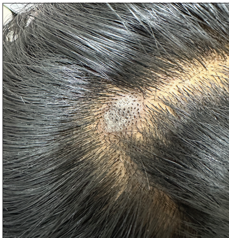
Figure 1: Solitary well-defined lichenoid plaque over the vertex of the scalp.