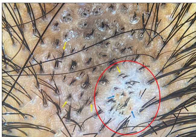
Figure 2: Trichoscopy (with interface liquid) ( \times 10 magnification) shows white structureless areas (red circle) with red dots (blue arrows) and monotonous clusters of broom hairs (yellow arrows) over the entire plaque.

ruled out based on potassium hydroxide mount and the absence of suggestive findings on trichoscopy and histopathology. Scalp dysesthesia, a variant of cutaneous dysesthesia syndrome, can also present with chronic itch over the scalp with secondary trichoteiromania and lichenoid changes. However, these patients often have a neurogenic cause and lack a component of OCD. [4] Trichotillomania was the closest differential but lack of typical trichoscopic findings such as the V sign, broken hair of uneven length, hook hair and flame hair along with histopathological findings of intact hair shaft ruled out its possibility. [5]