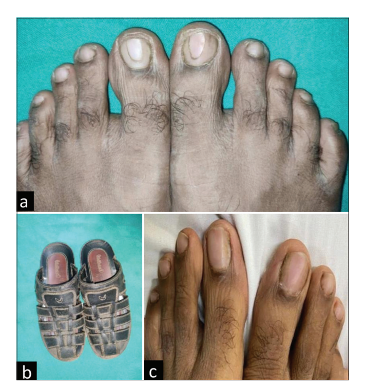
Figure 1: (a) Triangular area of thinning and redness seen on both great toe nails, (b) anteriorly closed shoes and (c) improvement after changing the shoes.