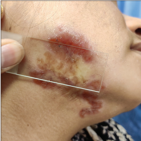
Figure 2: Diascopy showing apple-jelly nodules.