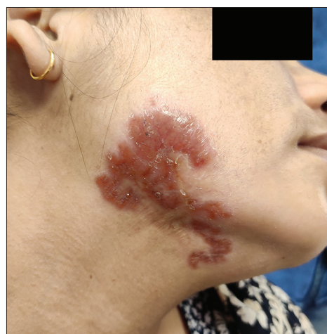
Figure 1: Solitary, reddish-brown plaque presents over the lower right cheek, with scarring at the inferior margin and serpiginous progression at the superior margin.

Cutaneous tuberculosis (TB) constitutes around 1% of extrapulmonary TB. Lupus vulgaris (LV), also called as tuberculosis cutis luposa or boeck's sarcoid, is a chronic, progressive, post-primary and paucibacillary form of cutaneous TB, occurring in a person with moderate to high